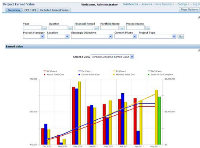
Figure 2. Earned value reports are automatically generated based on your dashboard filters.